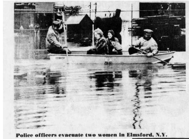
Police officers evacuate two women in Elmsford, N.Y.